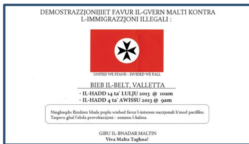
Figure 4 – Advertising a public demonstration against immigration

In the aftermath of the attempted push back to Libya in July 2013, a few public demonstrations were planned in protest of what organizers termed “illegal immigration,” defending the Government’s plans for migrants to immediately be repatriated to Libya upon their arrival. One of the pictures advertising a public demonstration against immigration disturbingly drew upon an emblem reminiscent of Nazi Germany, with the swastika being replaced by the Maltese cross: